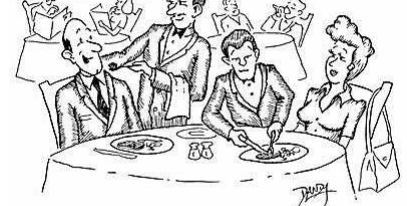
"Wow, they really baby you here!"

©OriginalArtist Reproduction rights obtainable from www.CartoonStock.com