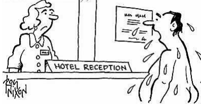
"THERE AREN'T ANY TOWELS IN ROOM 211."

©OriginalArtist Reproduction rights obtainable from www.CartoonStock.com